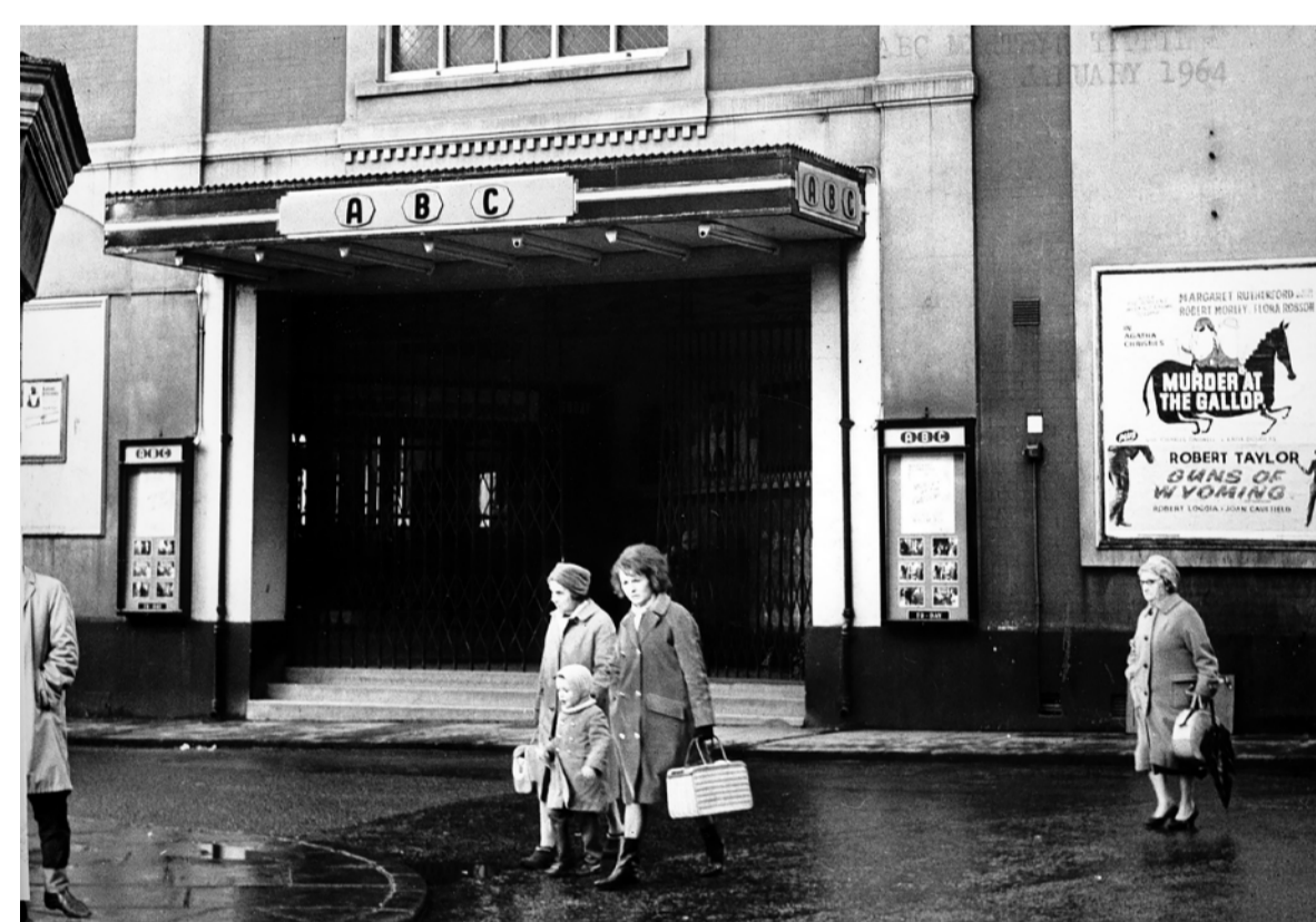
The ABC Cinema in 1964.