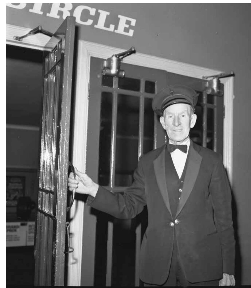
Castle Cinema Doorman.

The Castle Cinema, Pontmorlais, opened on June 29th 1912 with seats for 897 persons. By the end of the 1950s the Castle ceased to be a cinema but continued as the Palace Dance Hall. The building was demolished as part of a redevelopment program in the 1980s and the site is now a car park.