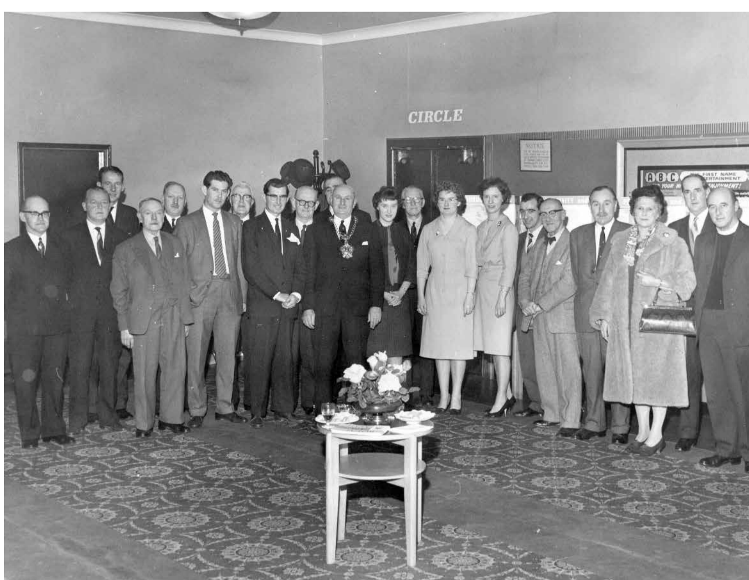
The Castle Cinema Changes to the ABC.