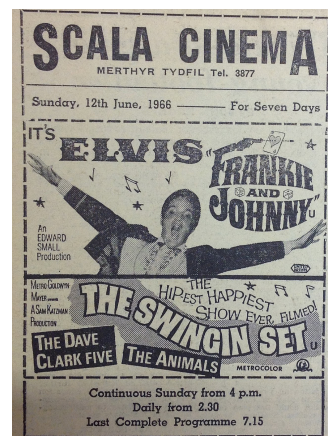
Scala Cinema Advert from the 1960s.

The Temperance Hall on John Street, opened in 1852 and is noted via a plaque as being rebuilt in 1888. The building is the only one of the old cinemas in Merthyr that is still in use, currently being used as a snooker club. It was also known as the Scala when used as a cinema.