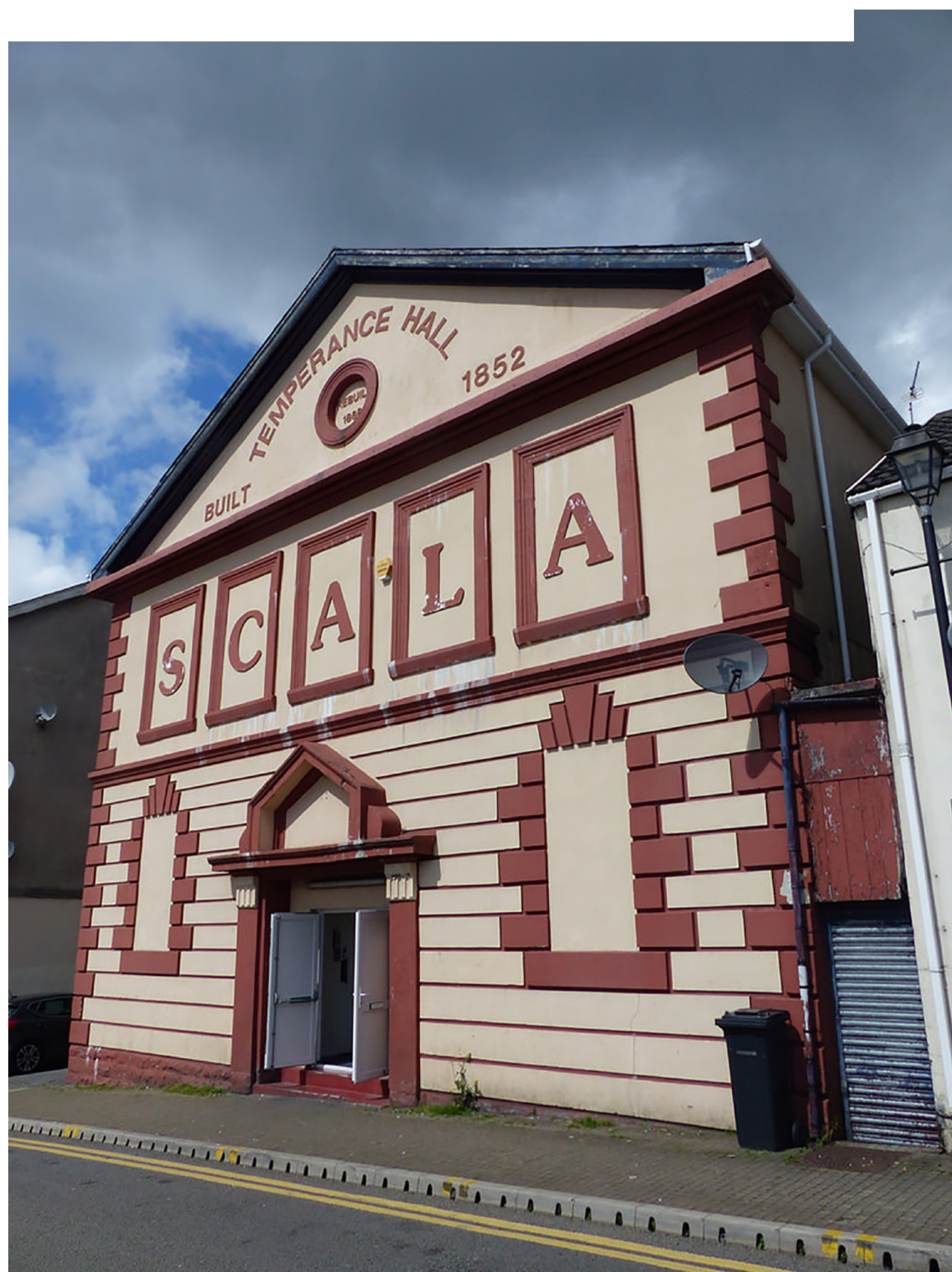
The Temperance Hall.